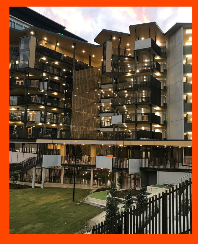
Fortitude Valley State Secondary College's Unique Vertical Design

Applications for enrolments in Year 7 in 2021 are open now. For more information, please contact the school enrolments officer at info@fortitudevalleyssc.eq.edu.au or visit https://fortitudevalleyssc.eq.edu.au/enrolments.