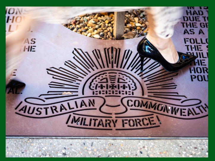
One of the tree grate designs on King St sharing the history of the precinct