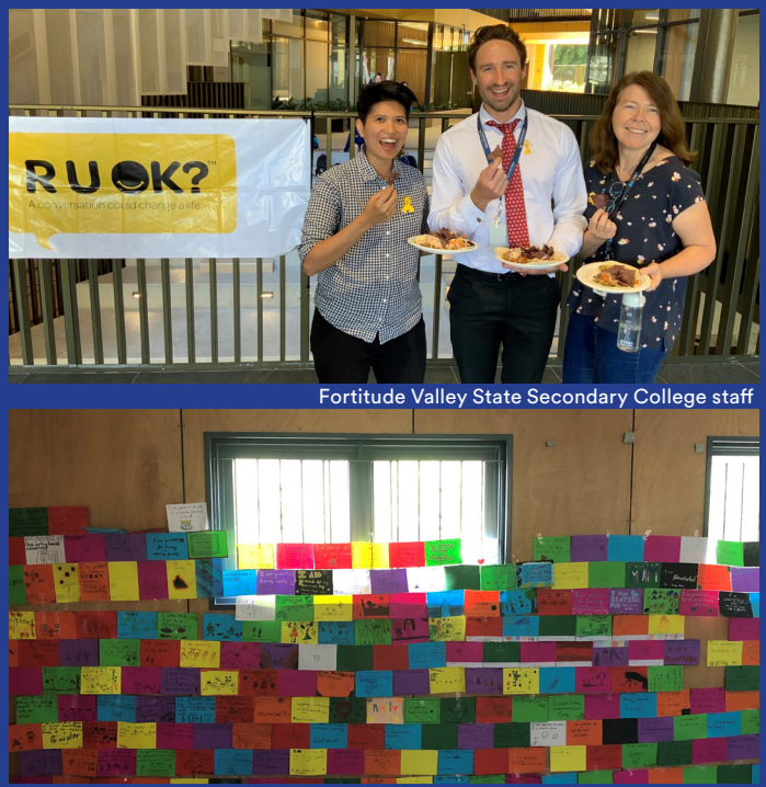
The gratitude wall created by Brisbane Central State School students and staff

"National days of action such as this are so important in raising awareness about the importance of mental health, you're never too young, or old for that matter, to look out for one another and ask R U OK?"